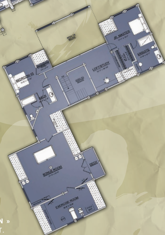
» 2ND FLOORPLAN » 1233 SQ. FT.